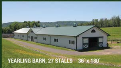
YEARLING BARN, 27 STALLS 36' x 180'