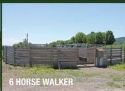
6 HORSE WALKER