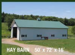
HAY BARN 50' x 72' x 16'