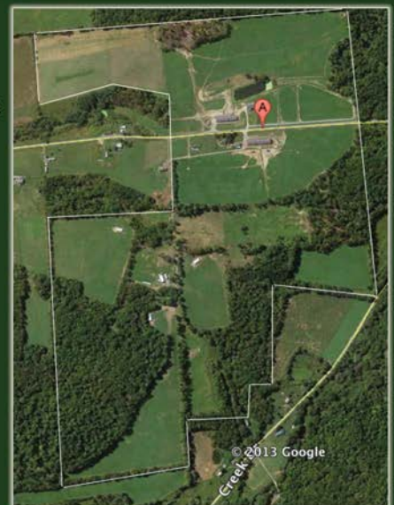
AERIAL VIEW OF THE WAYMART, PA PROPERTY