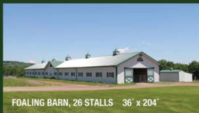
FOALING BARN, 26 STALLS 36' x 204'